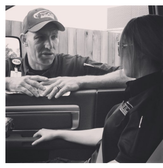
Providing a full range of benefits is a way to show how important you are to us.